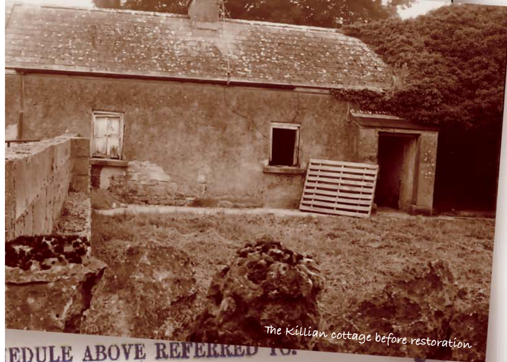
The Killian cottage before restoration