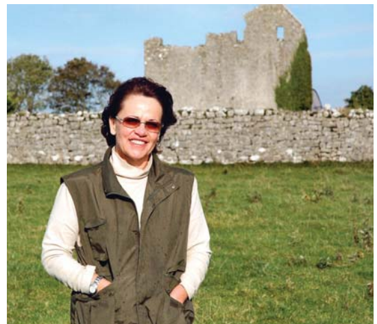
The Killian Homeplace has an adjoining compound of out buildings and gardens.