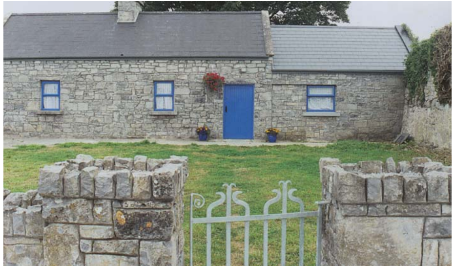
The Killian cottage as it looks today after the restoration.

hoods in Ireland. With their gifted storytelling, Irish farm life in the 1800s came alive for us, and we spent many happy hours, listening to stories and picturing our grandparents with their large families, happily tucked away in Irish cottages and doing their daily chores on the land.